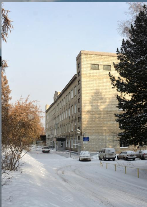
A.P. Vinogradov Institute of Geochemistry SB RAS, founded 1957/11/29

Irkutsk, Listvyanka (Lake Baikal, Hotel «Pribaikalskaya»)